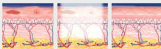
Red Blemishes from broken blood vessels and brown spots of pigment from sun damage respond to Intense Pulsed Light. The light is changed to heat energy as it reaches to the level of the collagen beneath the skin surface.

Intense Pulsed Light (IPL™) technology is a treatment breakthrough that can correct a variety of benign skin conditions, such as facial skin imperfections, birthmarks, unsightly small veins, brown pigment, age spots, freckles and sun damaged neck and chests.