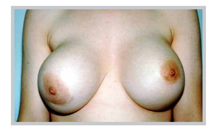
Photograph 1 shows Grade IV capsular contracture in the right breast of a 29-year-old woman seven years after placement of silicone gel-filled breast implants.

Grades III and IV capsular contracture are considered severe, and may require reoperation or implant removal. Capsular contracture, whether mild, moderate or severe, may occur more than once in the same implant.