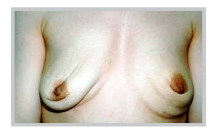
Photograph 3 shows deflated saline-filled breast implants in a 30-year-old woman.

Deflation occurs when the shell of a saline-filled breast implant tears or when the seal around the valve used to fill the implant is broken and liquid saline leaks out from the implant. When saline-filled breast implants deflate, loss of size or shape of the implant can be noticed immediately, or it may progress slowly over a period of days.