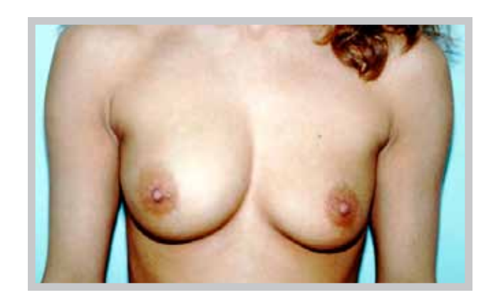
Photograph 2 shows a 29-year-old woman one year after having her silicone gel-filled breast implants removed. This is the same woman from Photograph 1.

One type of reoperation involves the surgical removal of your implants, which may or may not include implant replacement. As many as 20 percent of women who receive breast implants for breast augmentation have to have their implant removed within 8-10 years. Over the course of your life, you may need to have your implant removed due to local complications. Many women have their implants replaced, but some women do not. Women who do not have their implants replaced may have cosmetically undesirable dimpling, puckering, or sagging of the natural breast following implant removal.